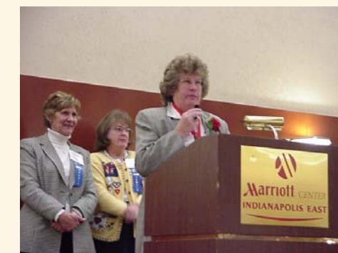
IEP Parent Conference