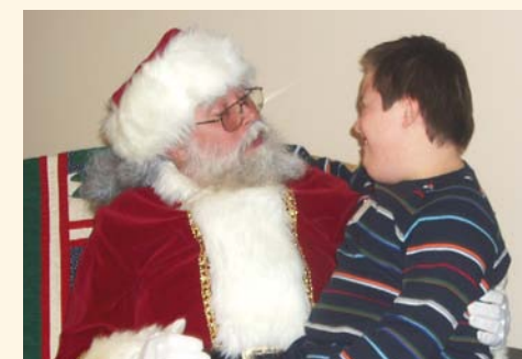
Annual Holiday Party

The IEP Parent Conference was repeated in February. The conference is an opportunity for parents of children with special needs to meet and discuss their experiences with the IEP process in their school systems.